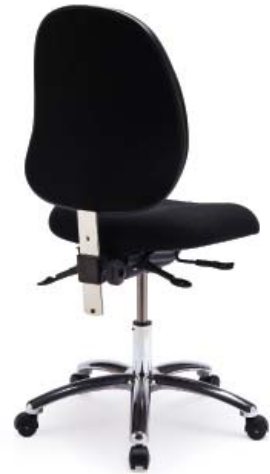
Nursing Station Chair, Large Back, Large Seat Shown with 26" Polished Aluminum Base and Chrome Back Bar Options