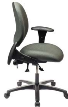
Nursing Station Chair, Large Back, Large Seat Shown with Swing Away Arm Option