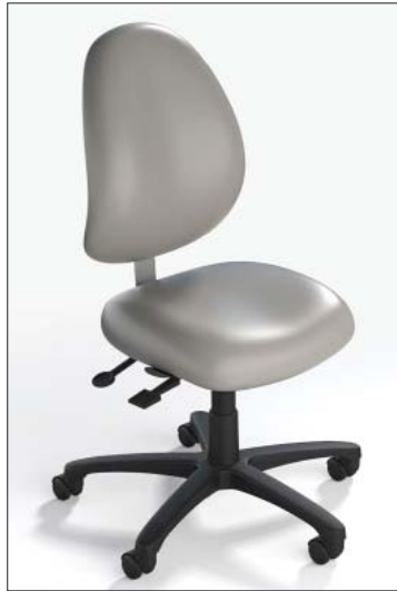
Nursing Station Chair, Large Back, Large Seat Shown with Chrome Back Bar Option