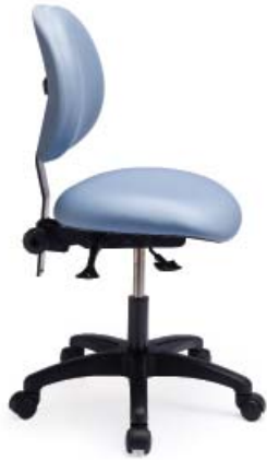
Nursing Station Chair, Small Back, Small Seat Shown with Chrome Back Bar Option