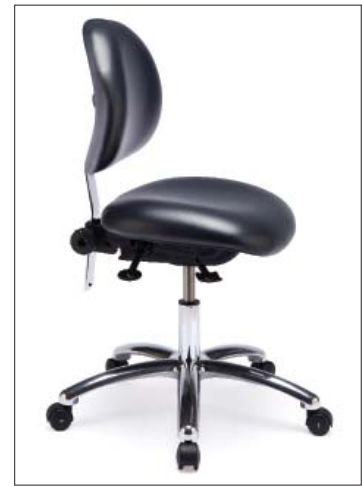
Nursing Station Chair, Small Back, Small Seat Shown with 26" Polished Aluminum Base and Chrome Back Bar Options