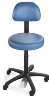
The Ultimate Medical Stool Black Package with IC+ Seat Style and Optional IC+ Seat-Back