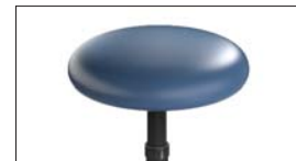
Upholstered / Vinyl Seat Style