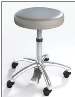
The Ultimate Medical Stool Chrome Package with IC+ Seat Style

The stool's high resilient seat foam ensures longer term comfort with no bottoming. The Ultimate Medical Stool can be customized with different seat sizes and a seat-back can be added to ensure comfort for multiple users and work requirements.