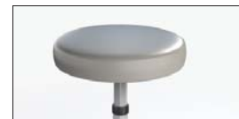
IC+ Seat Style